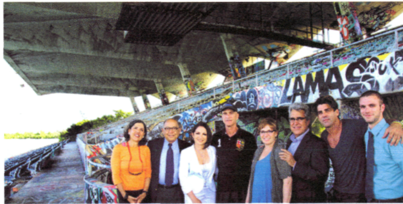
Gloria Estefan and Friends of Miami Marine Stadium

While we await City Commission approval, we've continue to gain momentum. The Miami Herald wrote a comprehensive editorial - their eighth and strongest - in support of our effort to restore the Marine Stadium. Please read this! The Miami Herald also broke the commitment of Gloria Estefan to our cause with a front page story .